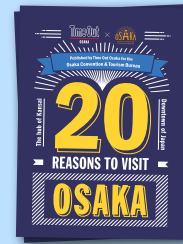
20 reasons to visit Osaka, the hub of Kansai