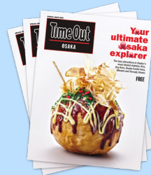
Time Out Osaka's guide to the five most vibrant districts in Osaka

Scan the QR codes to read these Osaka travel publications for free!